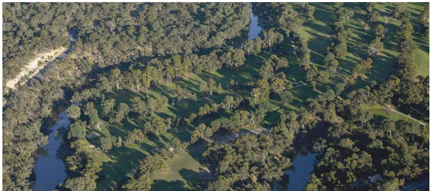
(Above) Yarra Bend as it is today.

Once a clear brief has been established and tested the next step is to prepare a Masterplan that incorporates all the proposed improvements. Before any work on site commences, the Masterplan should be fully costed, funding secured and a detailed construction program prepared. Consideration of staging need to be